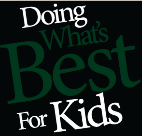
ALT FULL-COLOUR WHITE REVERSE ON A DARK BACKGROUND