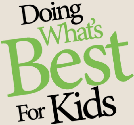
FULL-COLOUR POSITIVE ON A WHITE OR LIGHT-COLOUR BACKGROUND