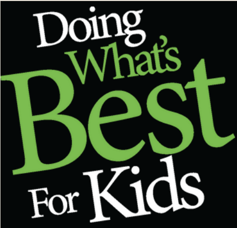
FULL-COLOUR WHITE REVERSE ON A DARK BACKGROUND