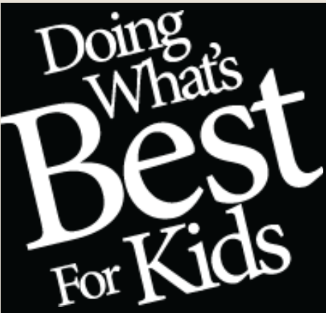
ALT ONE COLOUR WHITE REVERSE ON A DARK BACKGROUND