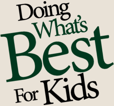
ALT FULL-COLOUR POSITIVE ON A WHITE OR LIGHT-COLOUR BACKGROUND