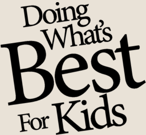
ONE COLOUR BLACK POSITIVE ON A WHITE OR LIGHT-COLOUR BACKGROUND